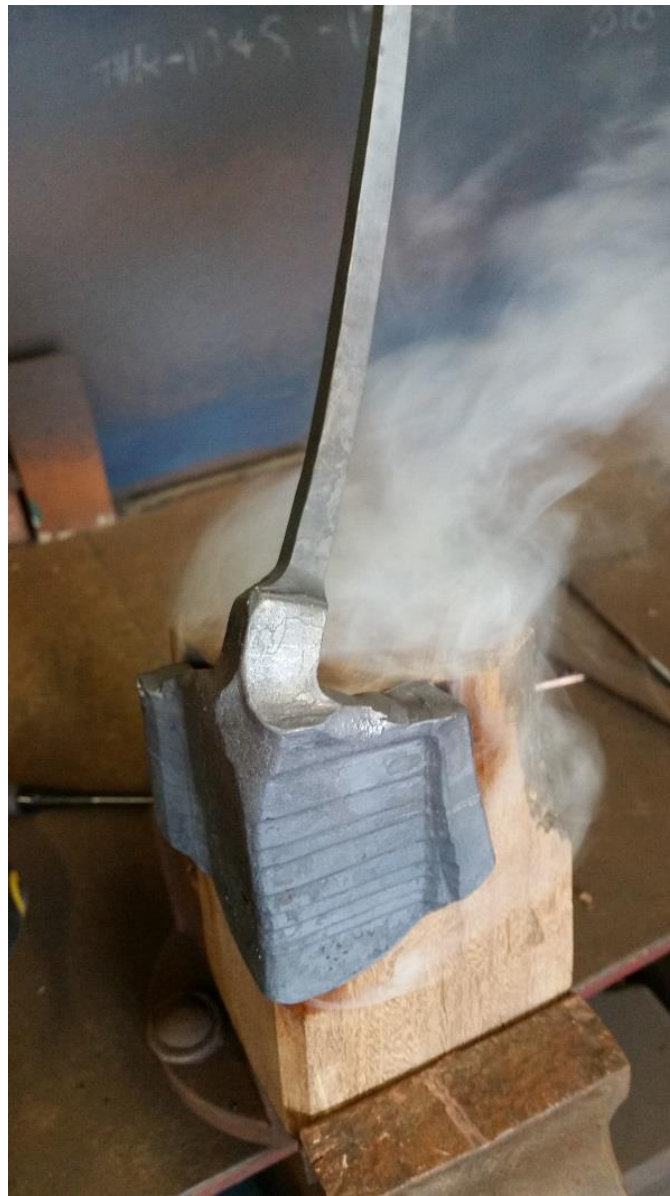
Will's work in progress

The timbers used were ironbark and turpentine over a hundred years old from an old wharf, the sheoak is from my parents' property from a tree which came down in a storm.