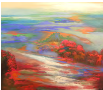
Astrid Dahl, The Cicada's Restless Song