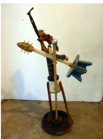
Ian Swift, Rock Star