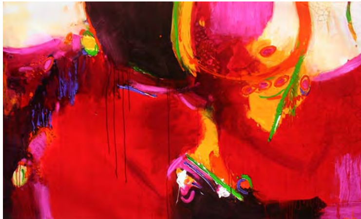
Judith Laws, Nearly The Full Circle Acrylic on Canvas, 120 x 195 cm