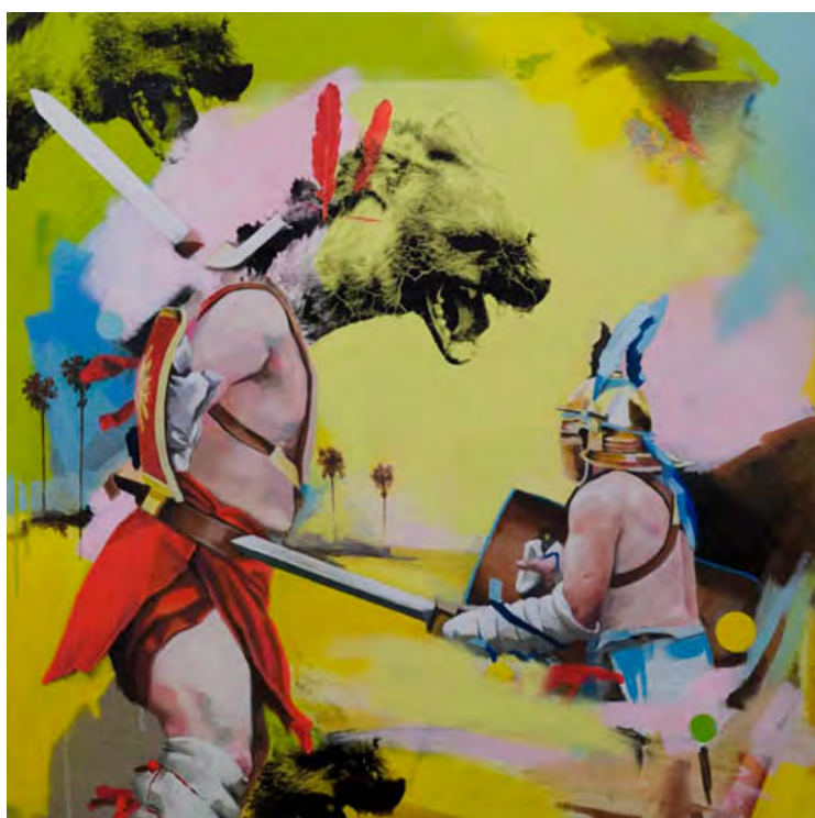
James Baker, La Guerra Civil Oil and Silkscreen Ink on Linen, 100 x 100 cm