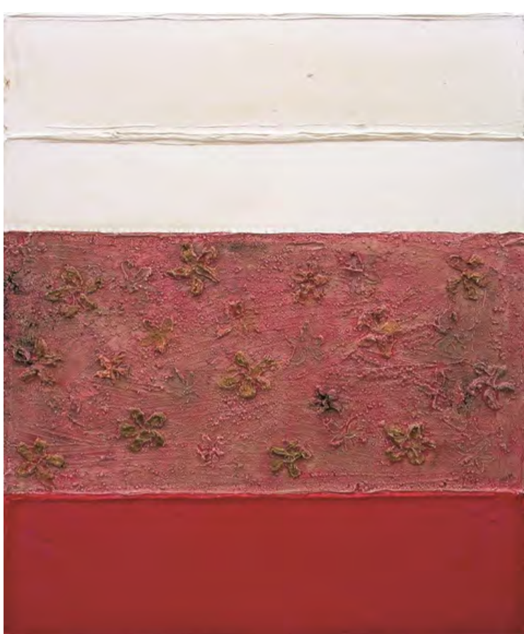
Gemma Lynch-Memory, Bloom No. 13 Oil & Mixed Media on Canvas, 120 x 100 cm

Gemma's works are abstract landscape compositions that feature rich and vivid colours. The iconographic markings and segregated space entice an emotive response and long, lonely horizons where "heaven meets earth" speak to our country yearnings. Organic debris made up of small sticks, soil, rocks and dried vegetation give the work a "living" quality and occasional hand-painted text introduce further depth and meaning.