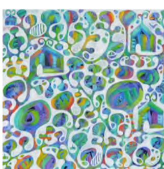
Nikki Perzuck, Ocean View