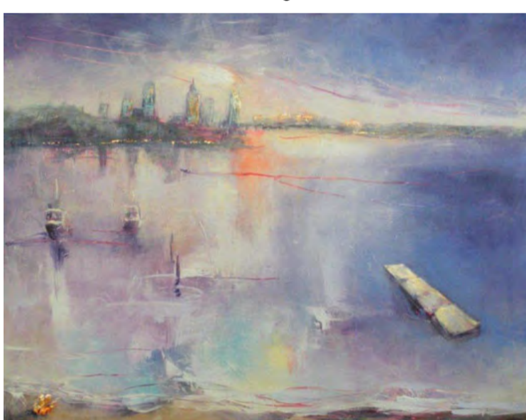
Di Taylor, Good Night For Prawning Acrylic on Canvas, 122 x 152 cm View more by Di Taylor