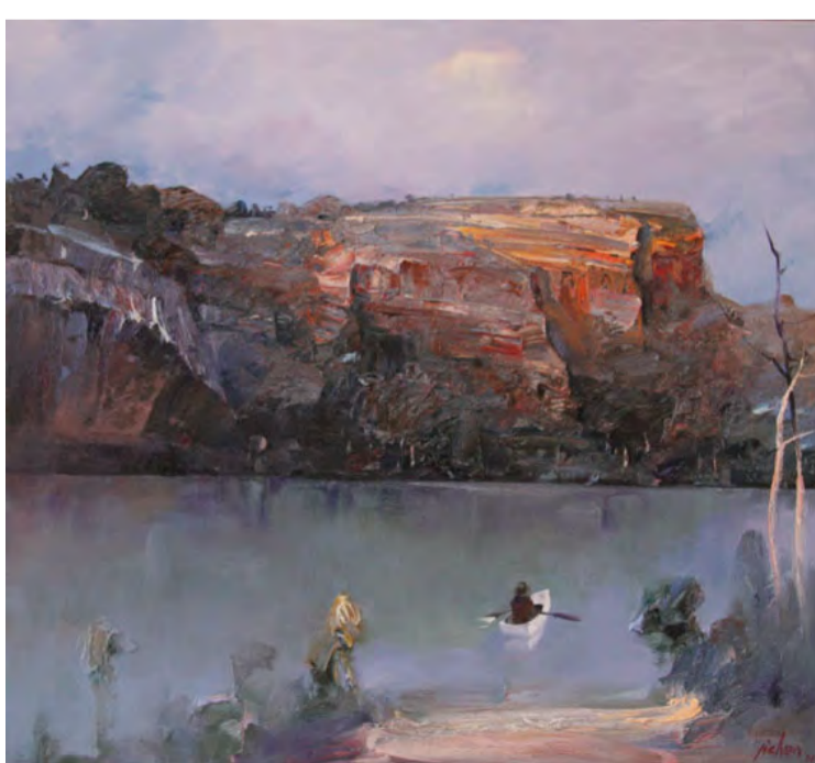
Ji Chen, River Bank (Katherine) Oil on Canvas, 120 x 130 cm View more works by Ji Chen