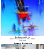
Ben Stack, One-Dig Yee Oil and Acrylic on Canvas, 150 x 100 cm View More