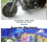
Jamie Schena, Farley Herley Mild Steel, 28 x 50 cm View more