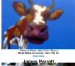
Rebecca Pierce, Wild Child - Matus Mixed Media on Canvas, 150 x 100 cm View more