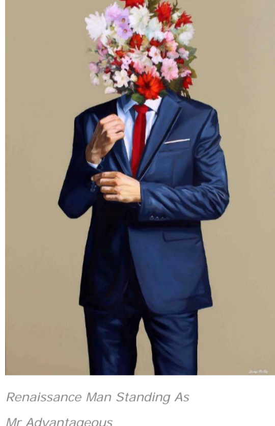
Renaissance Man Standing As Mr Advantageous 100 x 150cm combines. digitally drafted and hand painted on cotton $ 5,775.00