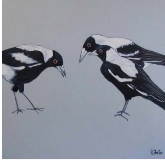
We Can Share 103 x 103cm acrylic on canvas $ 2,650.00