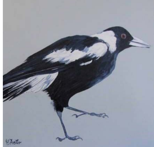
Want To Dance 103 x 103cm acrylic on canvas $ 2,650.00