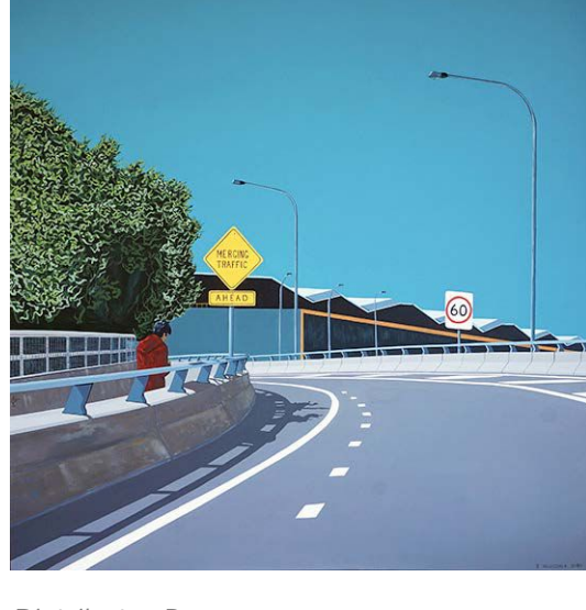
Distributor Progress 122 x 122cm acrylic on canvas $ 3,500.00