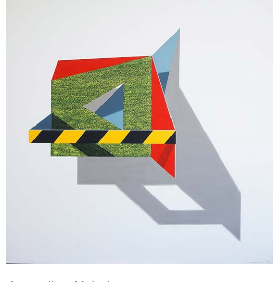
Ascending Melody 122 x 122cm acrylic on canvas $ 3,300.00